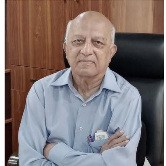
JUSTICE NASIR ASLAM ZAHID Chairperson

As we commemorate two decades of devoted service, I urge everyone to contemplate the brevity of life. Each evening, before concluding your day, consider the positive impact you can make tomorrow; it's our duty as a nation. Let us reaffirm our commitment to persistently strive towards our vision of extending legal support to those in need, offering a renewed opportunity for individuals entangled in the criminal justice system to forge a path toward a better life.