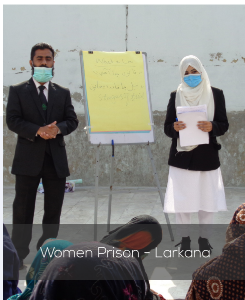
Women Prison - Larkana