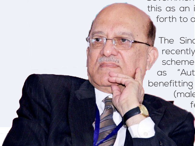
Justice (R) Nasir Aslam Zahid Chairperson - Committee for the Welfare of Prisoners

The number of old people behind bars is increasing at a remarkable rate across the globe. 20% of Japan's inmates are 60 years or older which is double the proportion since 2002. The number of prisoners aged over 60 years in the United Kingdom has jumped by 243% since 2002, to 5,176 in March, 2020. Estimates from the United States provide that by 2030 one-third of all prisoners will be older than 55 years. Whether the issue is one of being tougher on crimes resulting in longer prison sentences or of the elderly being forced into committing more crimes, an ageing prison population poses more challenges to the prison administration especially on account of the more acute health care needs of this strata.