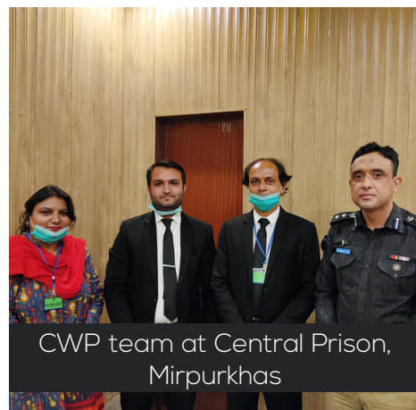
CWP team at Central Prison, Mirpurkhas

with safety measures in place. During the visit, the team received 25 requests for surety/ fines and appeals before High Court and Supreme Court which the CWP-LAO will be facilitating.