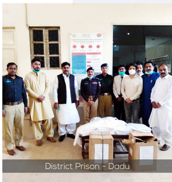
District Prison - Dadu