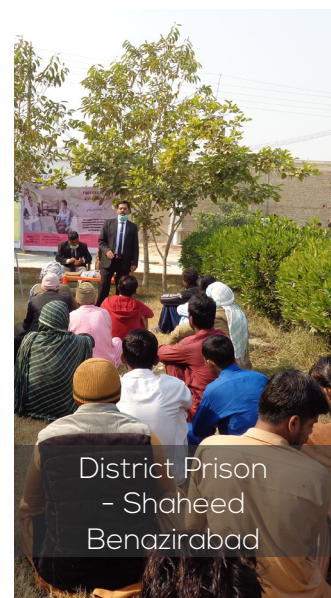
District Prison - Shaheed Benazirabad