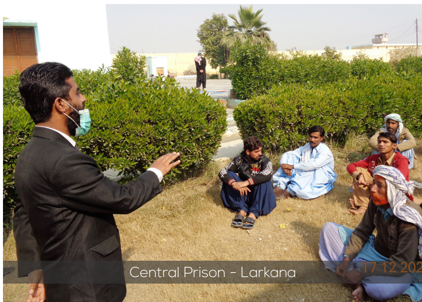
Central Prison - Larkana

We also disseminated multi-format IEC materials to inform prisoners about Prison rules, and the availability of mechanisms for access to justice, and for informing prisoners of their eligibility for support, legal aid, and social services that intervene with justice systems. CWP LAO will continue to run such camps in the future promoting awareness around the Sindh Prisons and Corrections Services Act 2019.